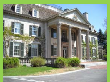
George Eastman Museum